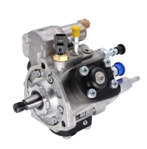
JOHN DEERE/PERKINS PUMP 4045T/6068T ENGINE