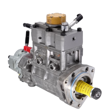
CAT/PERKINS C4/C6 ACERT

We carry over 4000 different filter references in stock