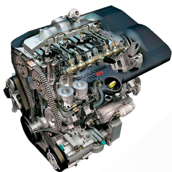
Ford Duratorq Engine

In 2014 Ford introduced the Euro6 EcoBlue Common Rail diesel engine, again this has over time progressively replaced the previous Common Rail engine and is still in production today.