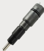
Bosch Mechanical Injector