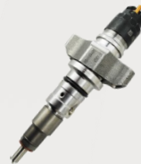
Bosch Common Rail Injector