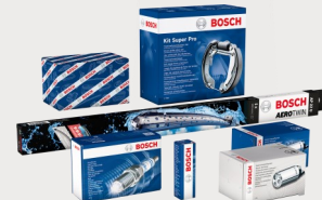
Bosch Repair Parts