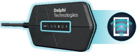
BLUE LIGHT Communication with the PC/tablet