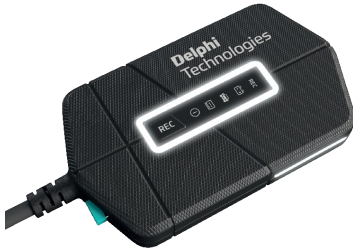
WHITE LIGHT VCI Power on