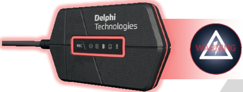
RED LIGHT Vehicle battery voltage warning