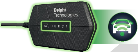
GREEN LIGHT Communication with vehicle