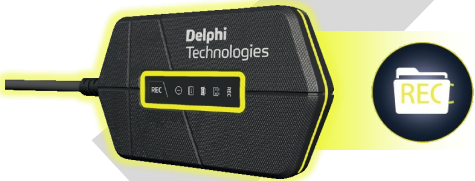
YELLOW LIGHT Flight recorder ON