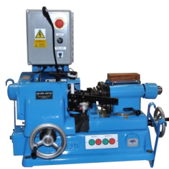
NR3B Needle Grinder