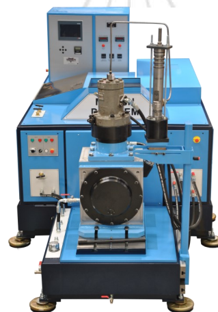
Merlin DC 80-Electronic Metering

We cater for all types of repair solutions for these products in addition to the older types of technology from all the world's leading engine manufacturers.